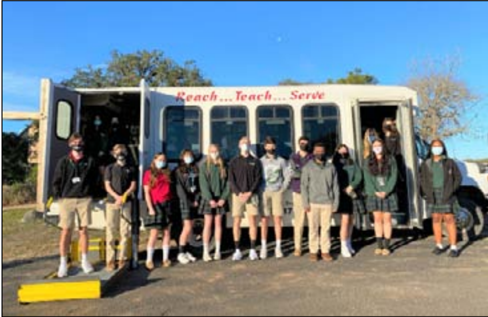
Students at the Baptist Christian Academy pose with the church bus after they purchased it for school activities.